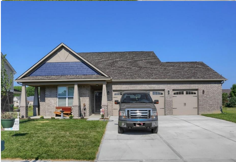
EXAMPLES OF LEGACY HOME SERIES (3 of 4)