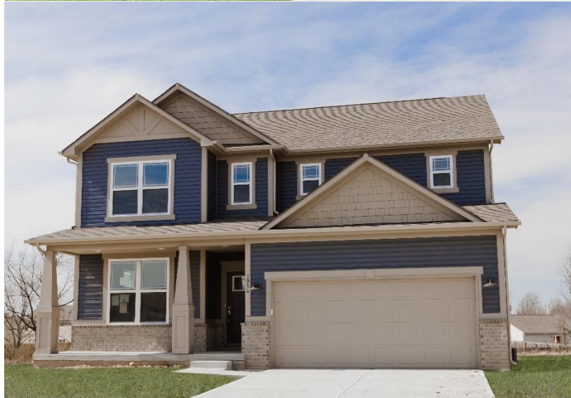
EXAMPLES OF LEGACY HOME SERIES (4 of 4)