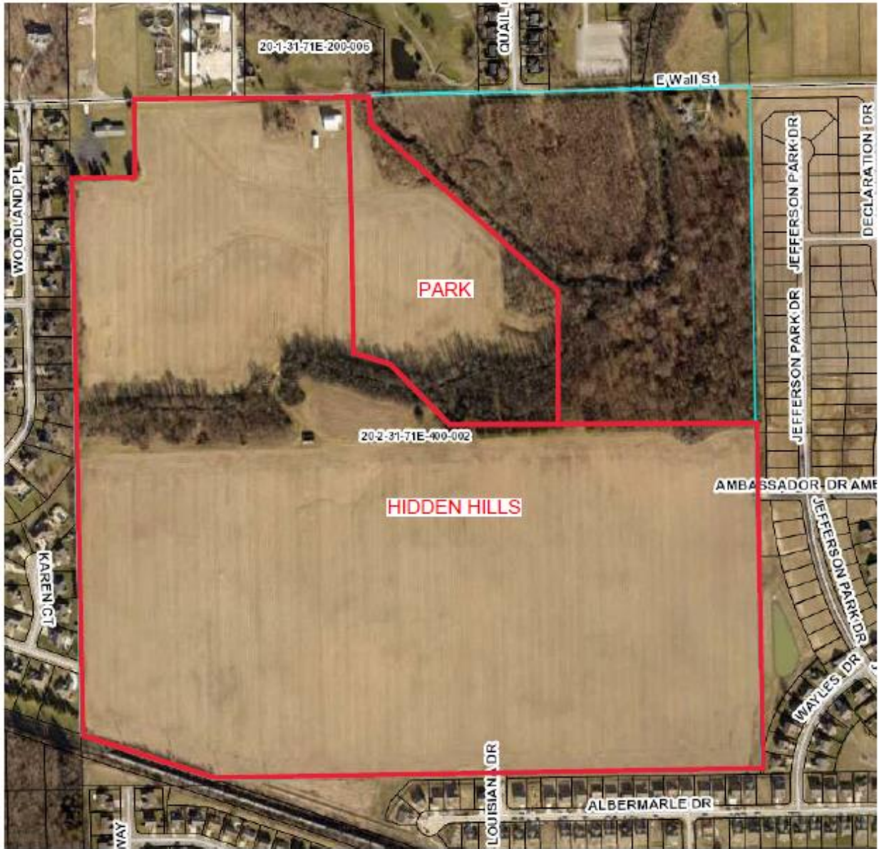
EXHIBIT A AREA EXHIBIT